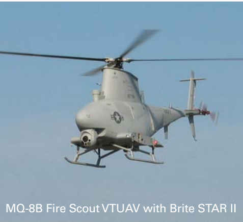
MQ-8B Fire Scout VTUAV with Brite STAR II

Benefitting from FLIR's experience operating Star SAFIRE III in the harsh desert climates of Iraq and Afghanistan, the Star SAFIRE LV is specifically tailored to land vehicle operations. Providing combat proven reliability and maintainability, Star SAFIRE LV is capable of long range target identification and geo-location, making it the ideal solution for vehicle RSTA missions.